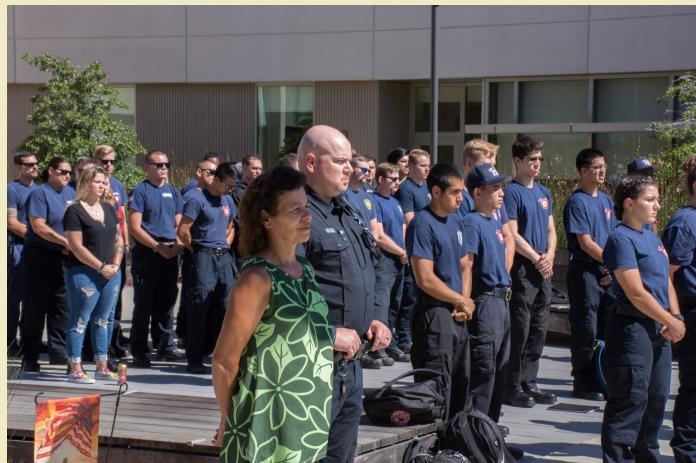
The LPC community honoring the flag during the National Anthem.