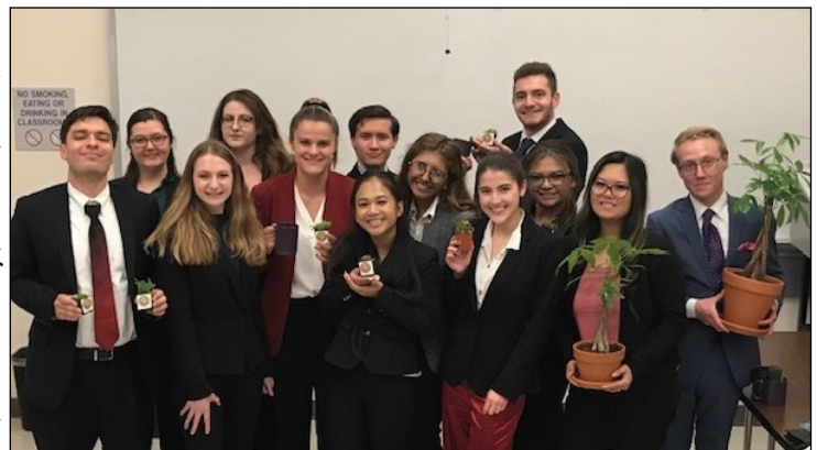
LPC Talk Hawks participants.