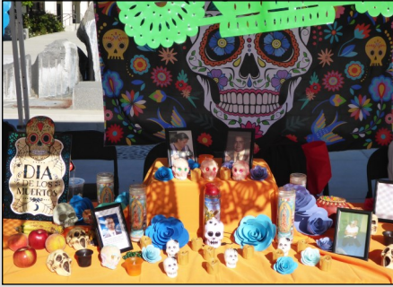
Dia De Los Muertos Celebration

On September 17, 2019, La Bienvenida/Welcome day was the kickoff of the LatinX Hispanic Heritage Month at LPC. During the months of September, October and part of November LPC invites the college community to experience the LatinX and Hispanic culture, art, music, and food. The college is hosting a