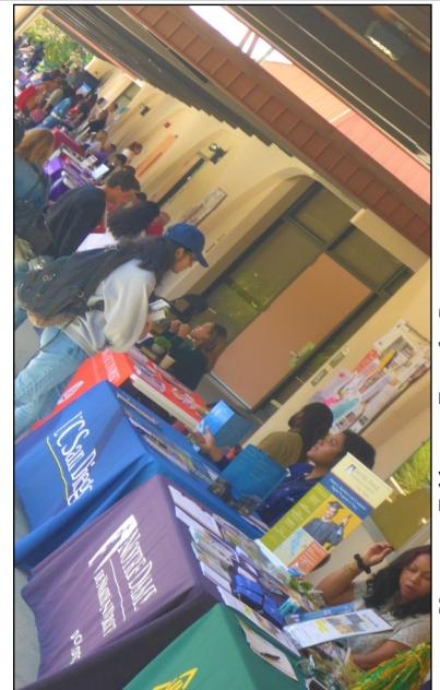
University Tabling on Transfer Day