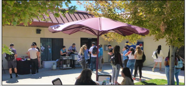
La Bienvenida/Welcome Day

On September 17, 2019, La Bienvenida/Welcome day was the kickoff of the LatinX Hispanic Heritage Month at LPC. During the months of September, October and part of November LPC invites the college community to experience the LatinX and Hispanic culture, art, music, and food. The college is hosting a