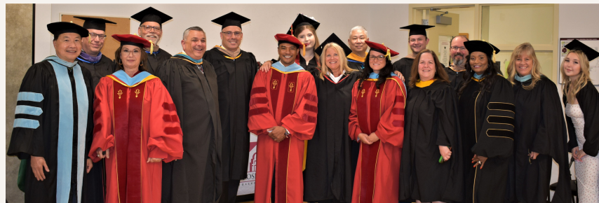
Above: Platform Party for Ceremony 1 Below: Faculty Participating in Commencement