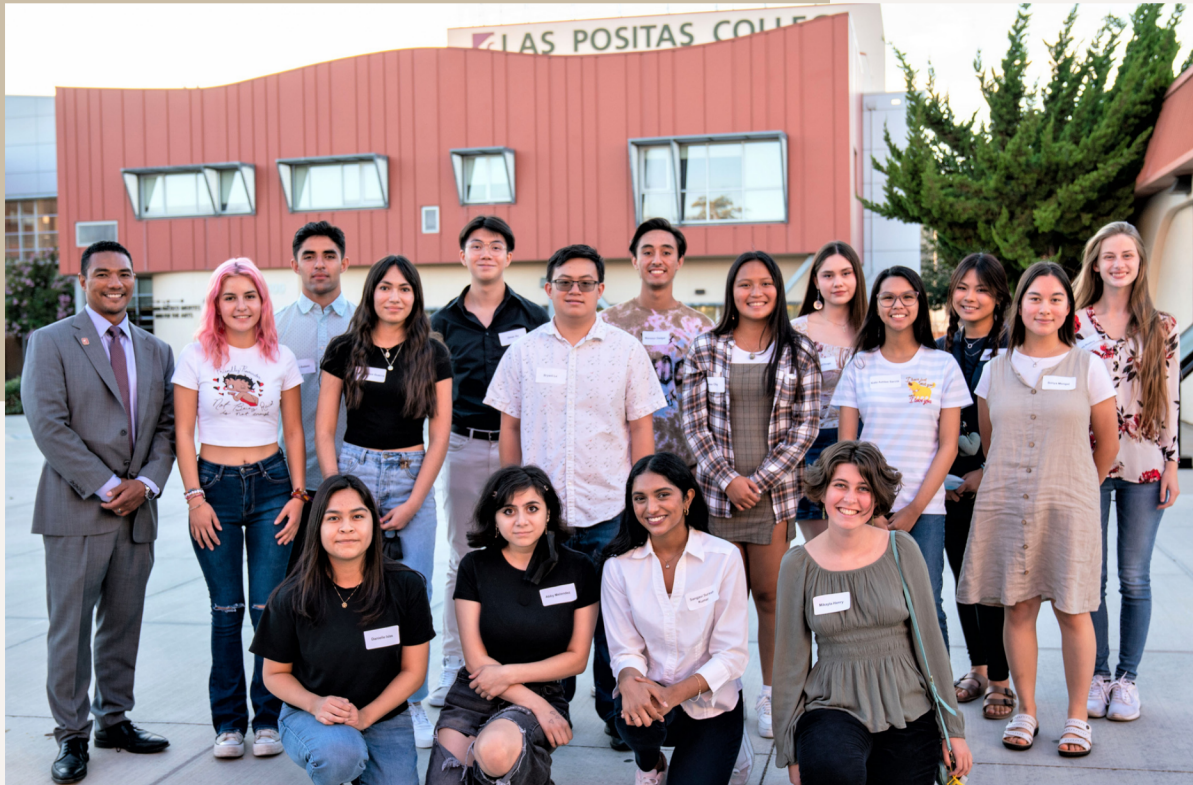
2022-2023 President's Scholars

Scan the QR code for more information and the application. Deadline to apply is March 26, 2023.