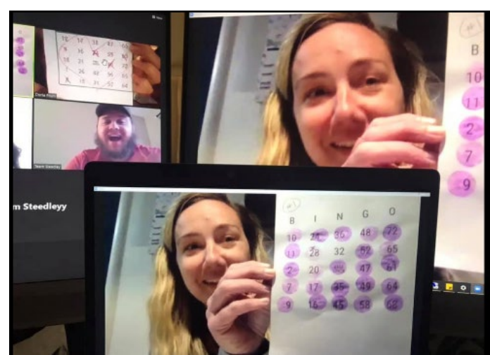
veterans who competed for prizes while celebrating a year of successful SVO activity and academics.

trees superimposed over an ocean sunset. The meeting had a jovial atmosphere and attracted many student veterans and their