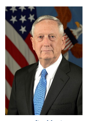
Jim Mattis January 25, 2017

Veterans Success Series: General Jim Mattis Special Roundtable with Las Positas College Veterans